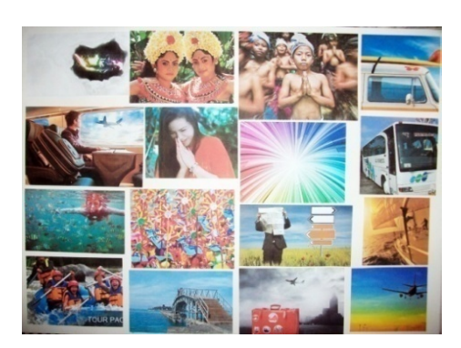
Figure 2 Mind mapping (left) and Mood Board (right)

Once the mind map and mood board have been developed, next exploration was through hand-drawn sketches. The sketches were created by narrowing down ideas from broad topic into more narrow ones.