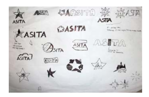
Figure 6 Final sketch progresses

In the next stage, the 8-pointed star symbolizing 8 wind directions was chosen and later developed into symbol of a compass. Along with it, the 5-pointed star sketch was also chosen as alternative.