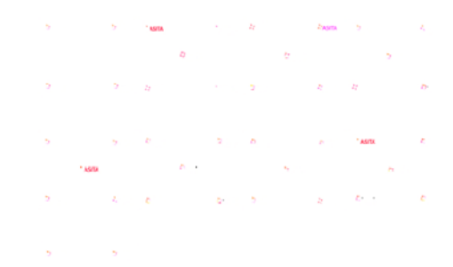
Figure 8 Final development of the visual identity